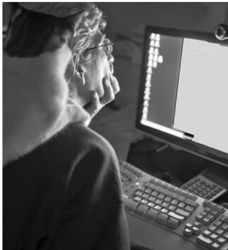
Both of our national conferences were online.

NWTRCC holds two national gatherings each year (May & November). Both were forced online by the pandemic.