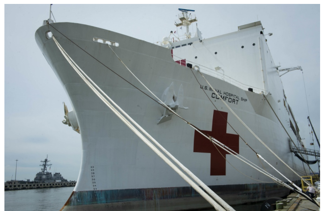
The U.S.S. Comfort: A Symbol of the Misplaced Priorities during the COVID-19 Pandemic.

The Northern California People's Life Fund hosted two granting ceremonies in which they distributed $34,000 in redirected tax monies to 23 organizations.