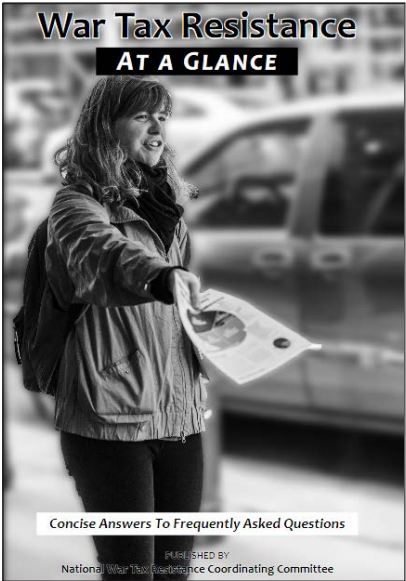
Cover to the updated "War Tax Resistance at a Glance" booklet. Cover photo by Ed Hedeman.

Every donation, no matter the size, keeps NWTCC going. Thank you!