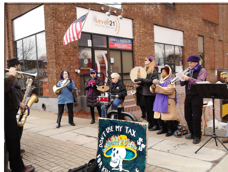
Tin Horn Uprising band at the Tax Day rally in Kingston, NY.

New England WTR redirected $6,900 tax dollars to groups such as the Asian American Resource Workshop, Student Immigration Movement, and The Youth Justice and Power Union.