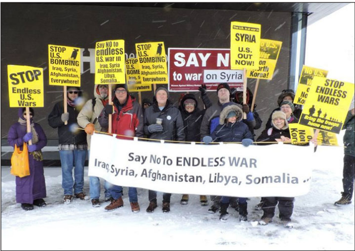
Minnesota War Tax Resistance with the Minnesota Peace Action Coalition Tax Day Demonstration in the snow.