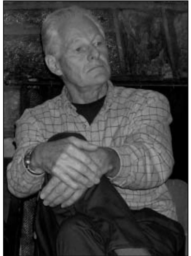
"Wars will cease when men and women refuse to fight them, refuse to pay for them, and refuse to profit by them."