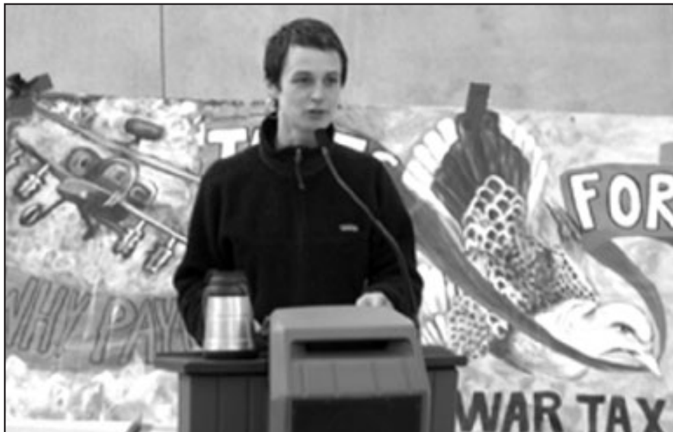
Julia Butterfly Hill speaking at October 15 press conference in front of the Federal Building in San Francisco.