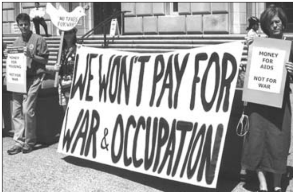
IRS Headquarters, Washington, DC, April 15, 2003.