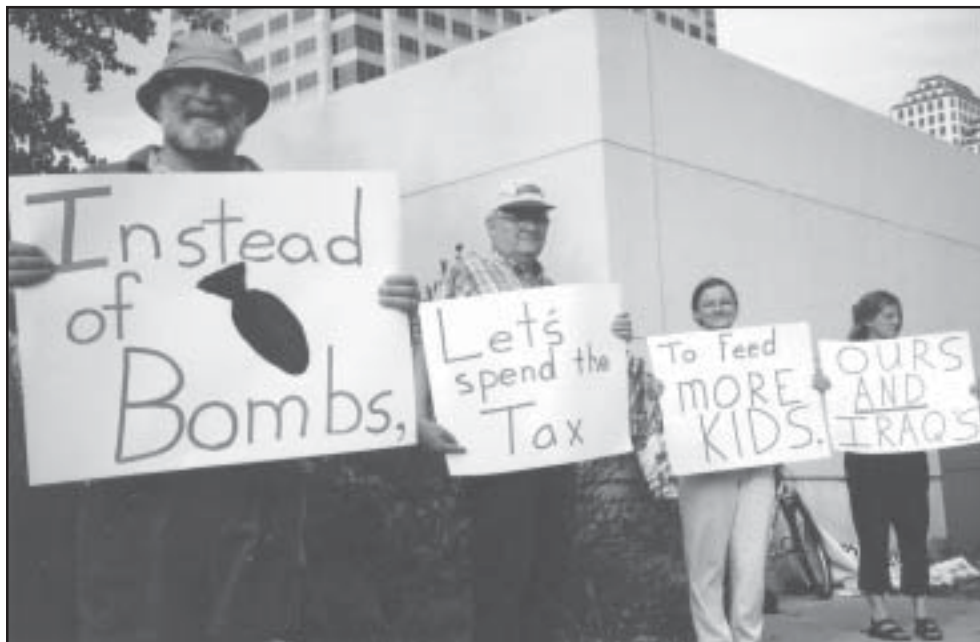
Members of Austin Conscientious Objectors to Military Taxation hold "Burma Shave"-style signs at the Central Post Office, Austin, TX.